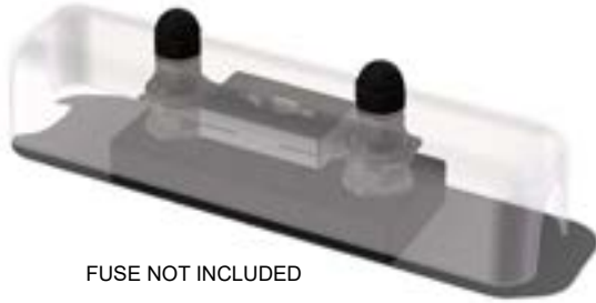
FUSE NOT INCLUDED