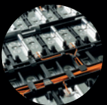
BATTERY MANAGEMENT SYSTEMS